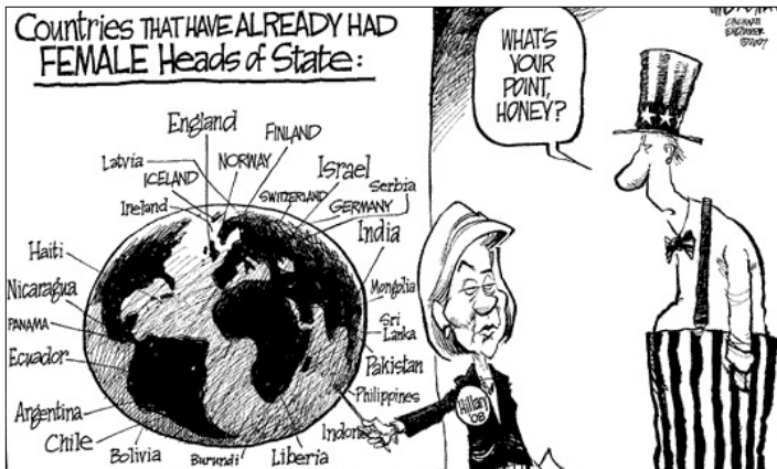
Borgman © 2007 Cincinnati Enquirer Reprinted by permission of Universal Press Syndicate. All rights reserved.